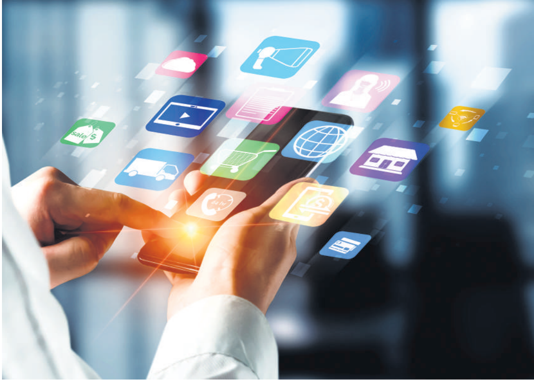
The number of requests Alphabet has received from regulators and courts to remove apps from its Google Play store has risen from 496 in 2019 to 1,743 last year. In 2022 Apple removed 1,474 apps from its store.

are trying to pry open the app-store duopoly. Among other things, the EU's Digital Markets Act (DMA) compels tech firms to allow other app stores to operate on smartphones, a freedom Apple has not previously granted iPhone users. Japan's government is trying to pass a bill with a similar aim. Britain is probing the app-store business, too. India's government is so eager to introduce competition to the market that it has considered launching its own app store. Plenty of developers are on their side. In 2019 Spotify, a music-streaming service, lodged a com-